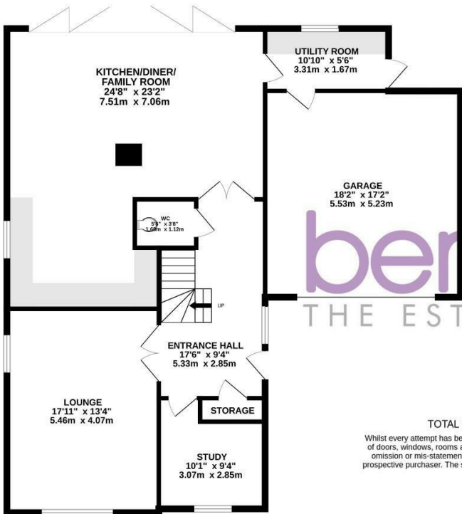
GROUND FLOOR 1329 sq.ft. (123.5 sq.m.) approx.